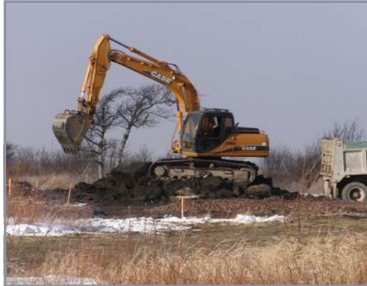
Work underway on the Joggins Fossil Cliffs Interpretive Centre, scheduled to open this summer.

"The Joggins Fossil Cliffs are a tremendous resource for Nova Scotia in terms of preserving our